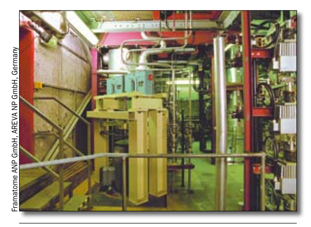
PKL test facility in Erlangen, Germany.

Three tests were carried out in 2006. Their preparation and the first test outcomes were extensively discussed at the two meetings of the project steering bodies that took place during the year. A workshop covering an analytical exercise with code predictions related to the PKL tests was also held in 2006. The project is set to continue until May 2007 to enable completion of the final report.