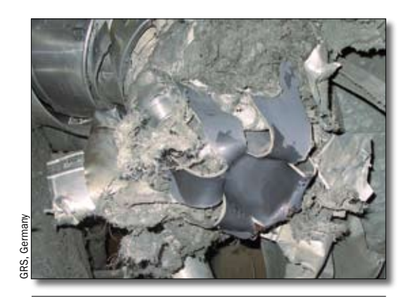
BWR piping at the Brunsbuettel NPP in Germany after a hydrogen explosion.

The ICDE Project comprises complete, partial and incipient common-cause failure events. The project currently covers the key components of the main safety