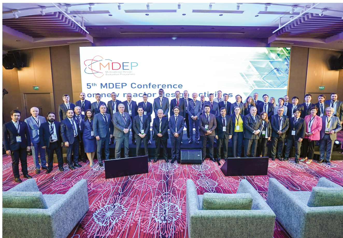
Figure 5.2: Participants of the 5 th MDEP Conference

Some of the future MDEP activities agreed on during the conference were: the launch of the activities in order to establish an MDEP Safety Assessment School, with early discussions taking place with Khalifa University; a potential workshop with industry aimed at SMR designs under construction or licensing as well as the possible creation of a working group focusing on SMR technology; the need to consider other nuclear technologies and the promotion of MDEP activities aimed particularly at non-NEA countries for the purpose of opening membership to the Programme.