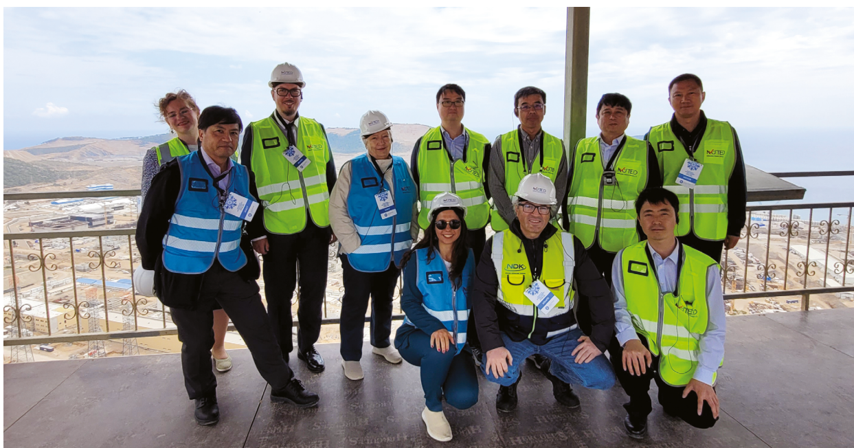
Figure 5.1: MDEP participants visiting Akkuyu NPP construction site

Finally, a second VVERWG workshop with industry was held on 27-29 October 2021, via teleconference, during which the following topics were discussed: usage of PSA in nuclear power plant design, supply chains and validation/verification of FOAK equipment. As a follow-up, there are two topics under consideration within the working group as potential new activities: supply chains and risk informed regulatory activities. The next workshop will be held in 2024 to discuss issues related to VVER-1200 design differences, results of the FOAK tests performed by then and long-term heat removal design solutions.