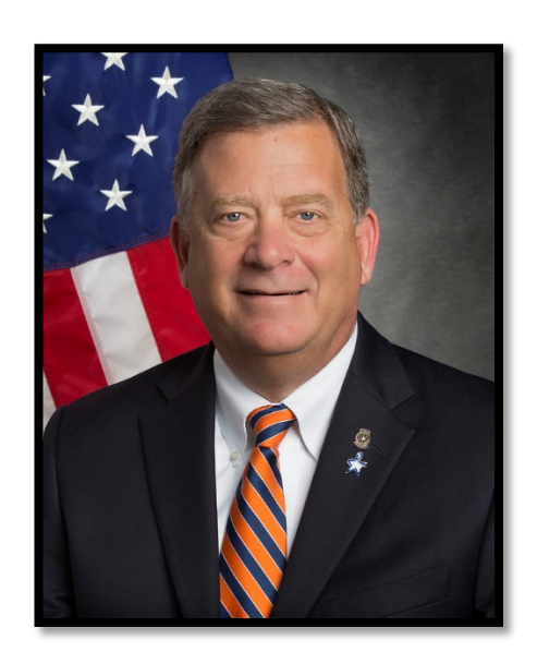
Commissioner US Nuclear Regulatory Commission