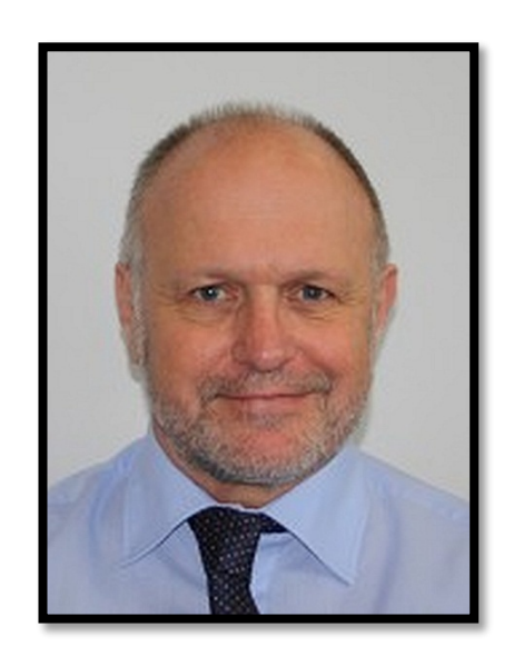
Consultant Federal Authority for Nuclear Regulation (FANR) Abu Dhabi, United Arab Emirates

Retired Project Officer Regulatory Infrastructure and Transport Section, International Atomic Energy Agency (IAEA)