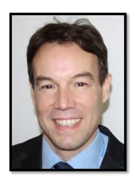
Legal Officer Non-Proliferation and Policy Making Section, Office of Legal Affairs, International Atomic Energy Agency (IAEA)