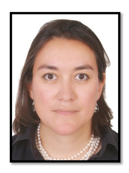
Head Office of Legal Counsel, Nuclear Energy Agency