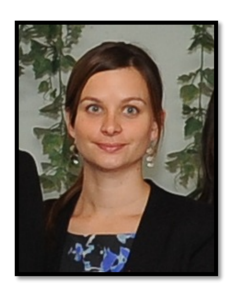
Programme Director for National Implementation, Verification Research, Training and Information Centre (VERTIC)