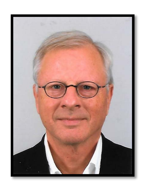
Former Senior Nuclear Insurance Expert

Former Director Nuclear Energy Swiss Reinsurance Company