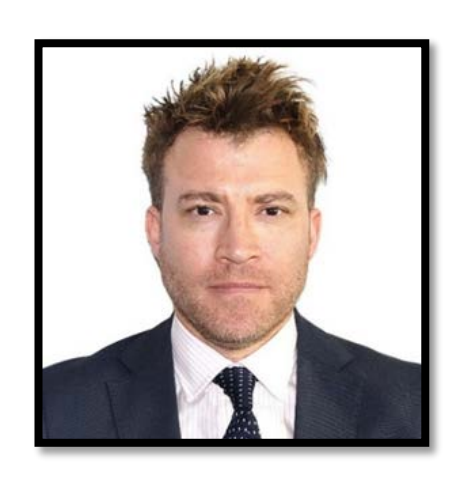
Legal Officer, Nuclear and Treaty Law Section, Office of Legal Affairs, International Atomic Energy Agency (IAEA)