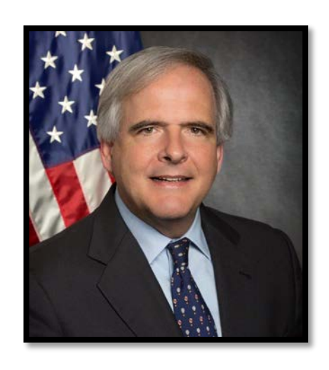
Former Commissioner US Nuclear Regulatory Commission

Former Head of Legal Affairs Nuclear Energy Agency