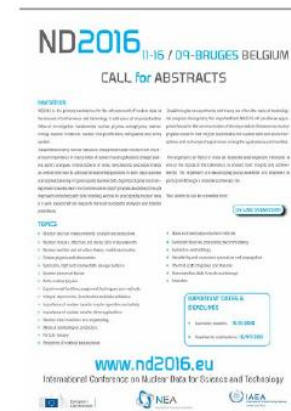
ND2016 call for abstracts.pdf