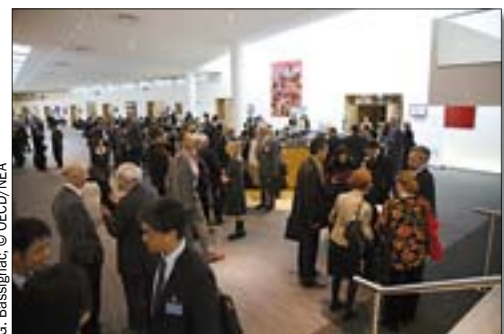
G. Bassignac, © OECD/NEA